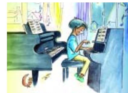
The Little Pianist

So thank you Pedro Almodóvar for making Women on the Verge of a Nervous Breakdown! Strangely, it is contributing to global literacy.