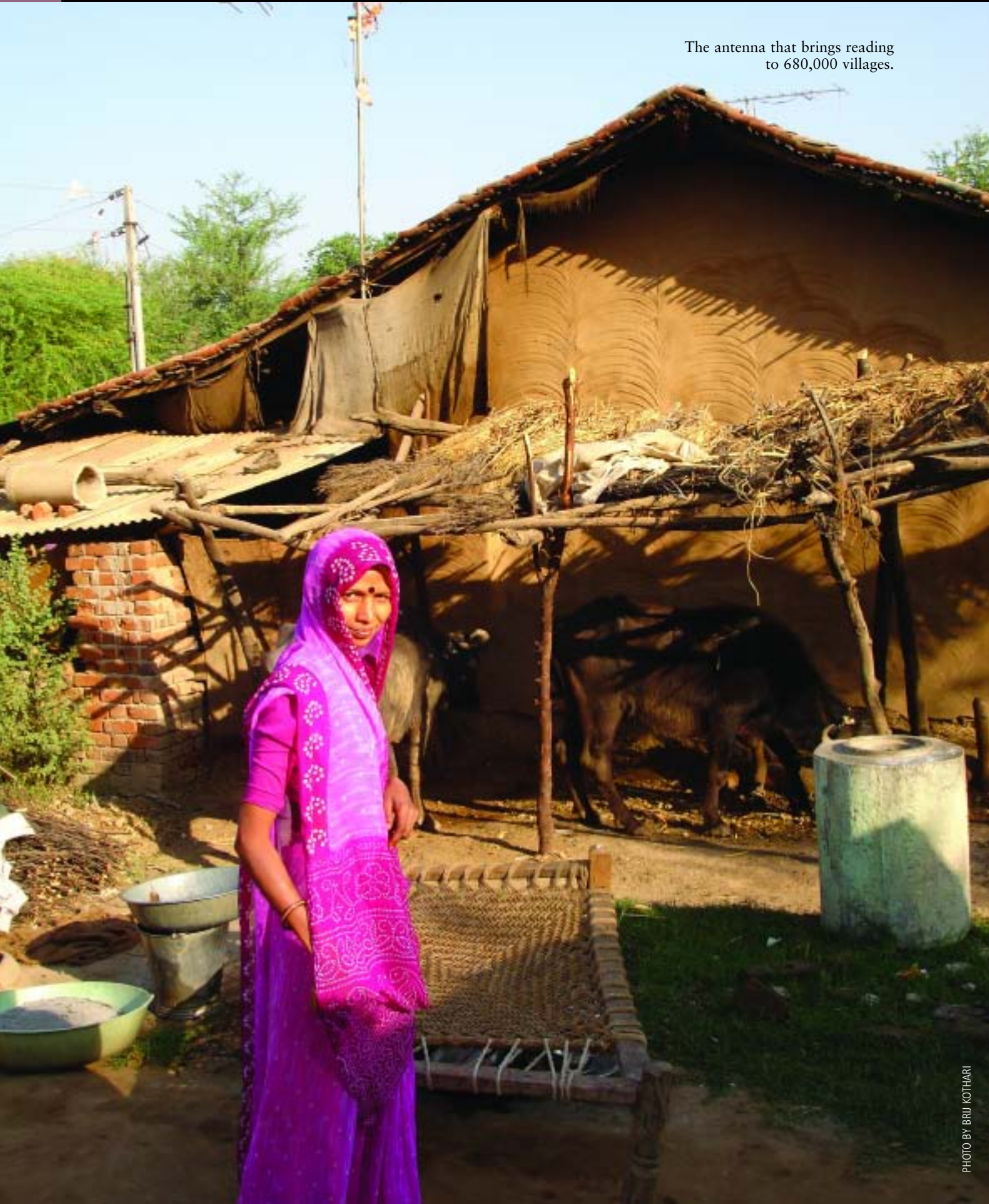
The antenna that brings reading to 680,000 villages.