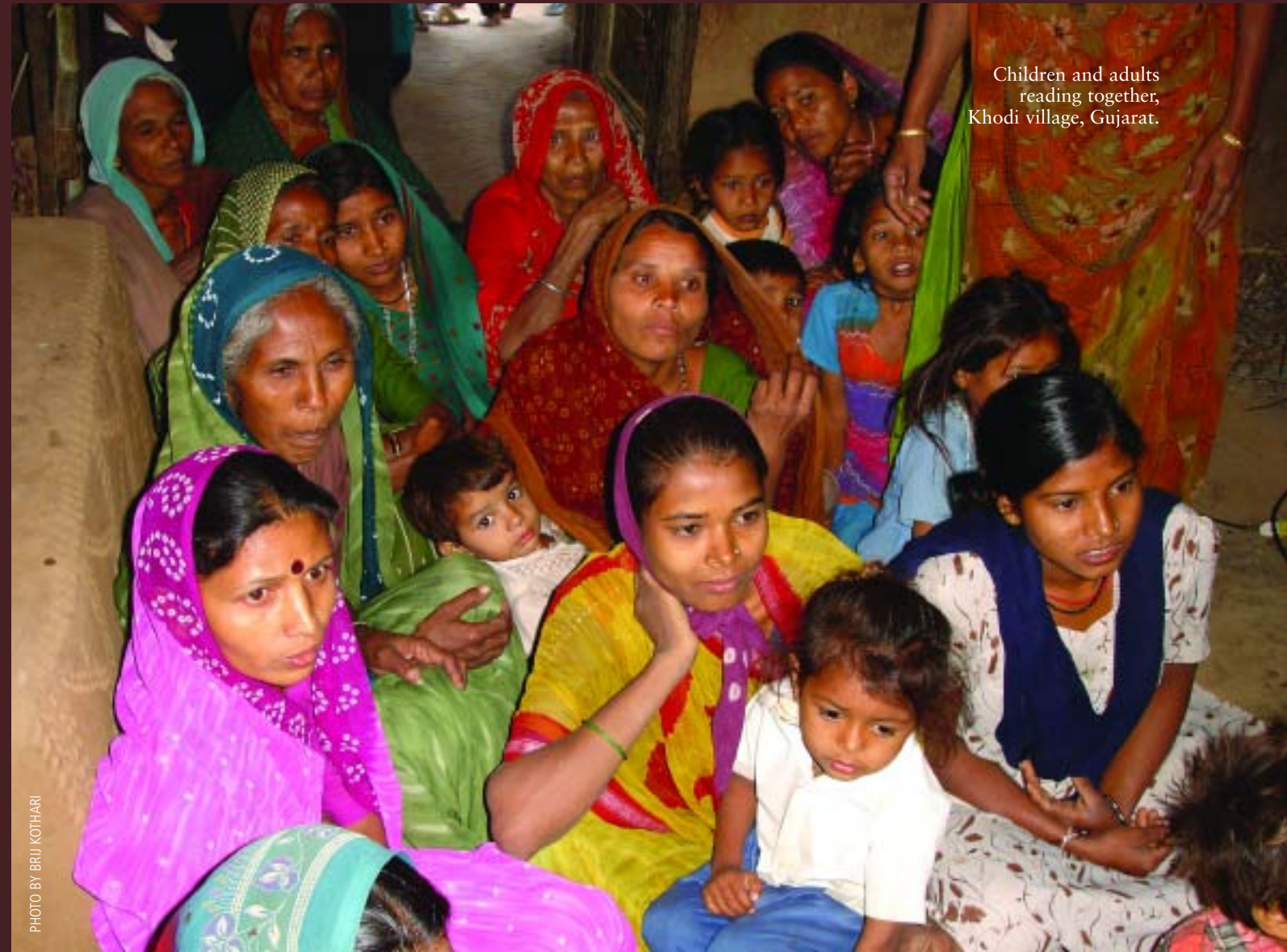
Children and adults reading together, Khodi village, Gujarat.