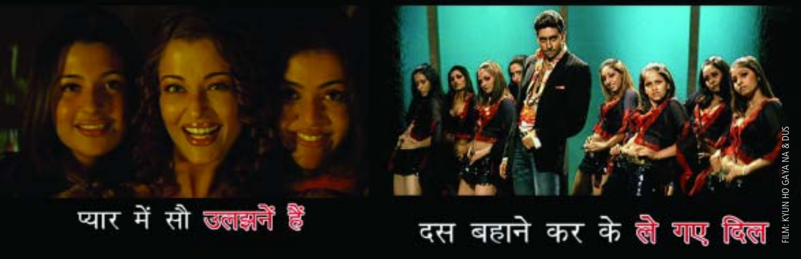
FILM: KYUN HO GAYA NA & DUS